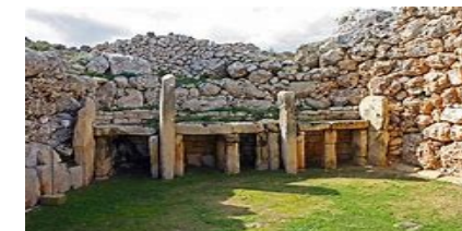
Stone age Dwelling