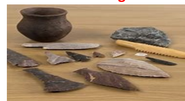
Stone age tools made of flint