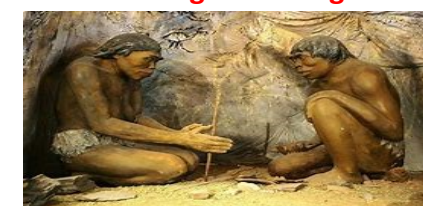
Using tools to make fire