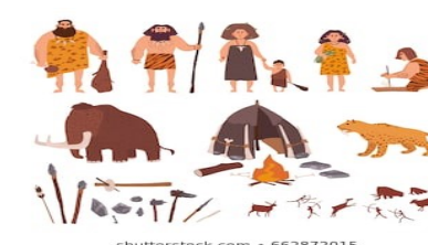
Stone age Life