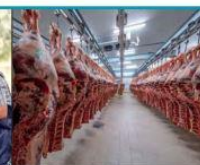
The cows are killed and the meat matures.