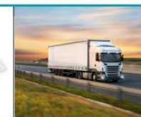
The food is transported to shops.