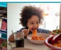
The food is consumed.