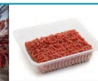
The meat is processed and packaged.