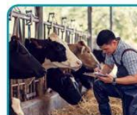
Farmers rear cows.