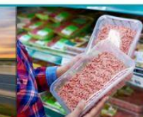
Customers buy beef products.