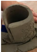
Making an imprint