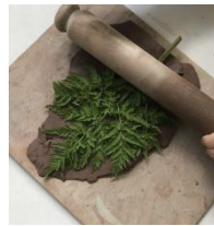
Rolling a vessel